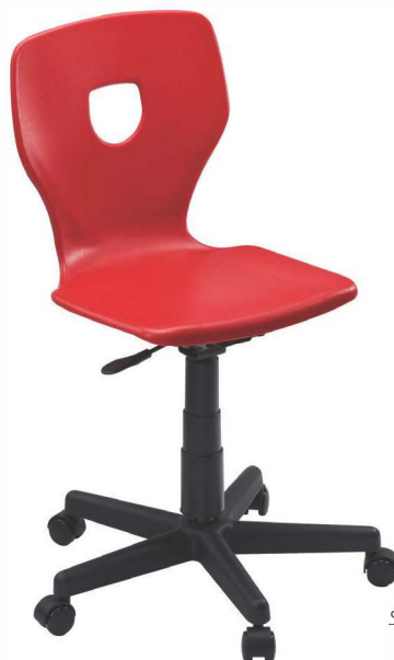
Shown in 15.5"D, 17"W, 20"H Ruby seat, Black frame.