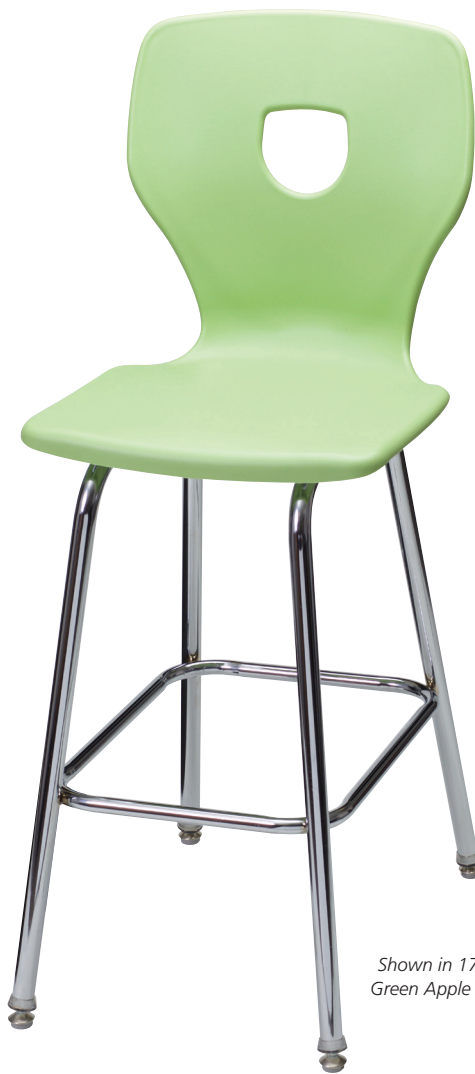
Shown in 17"D, 15.5"W, x 27"H Green Apple Seat, Chrome frame