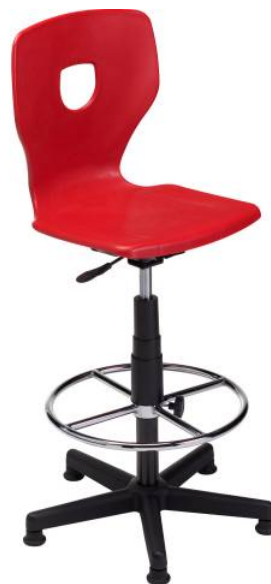
Shown in 15.5"D, 17"W, 24"H Ruby seat, Black frame.