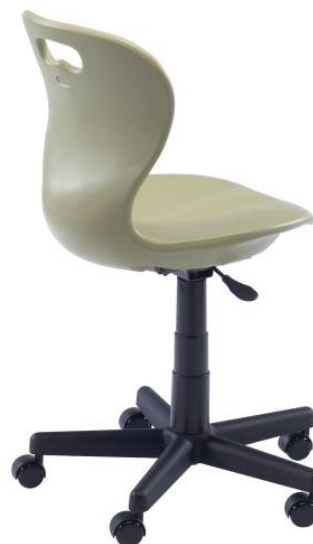
Shown in 16.5"D, 16"W, 20"H Pumice seat, Black frame.