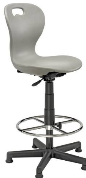
Shown in 16.5"D, 16"W, 22"H Pumice seat, Black frame.