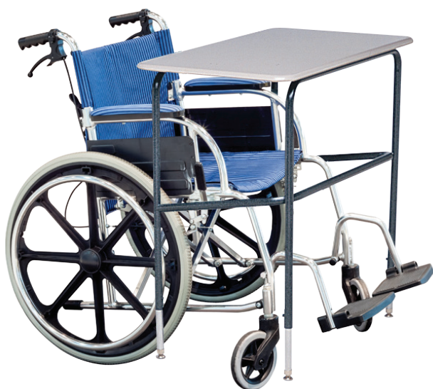
Shown in adjustable height. Light Gray top, Black Diamond frame