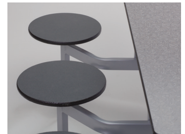
Cafeteria Table Seat Option 13" diameter Russian Birch Stool Seat with Duro Edge