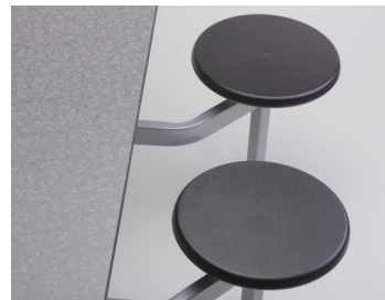
Table Seat Option 13" diameter Polypropylene Stool Seat