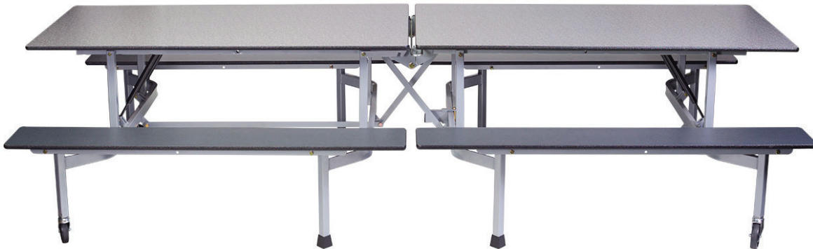
Top Charcoal Boomerang, Seat Charcoal Boomerang, Edging Black, Platinum frame